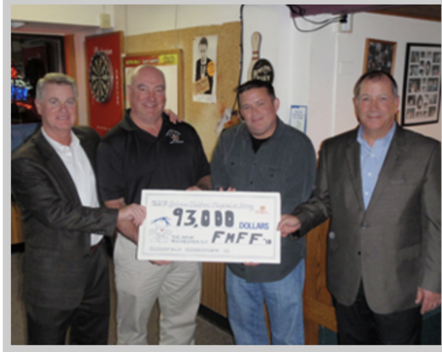
Representatives of the Fairport Food & Music Festival present Golisano Children's Hospital with proceeds raised at its annual charity event.